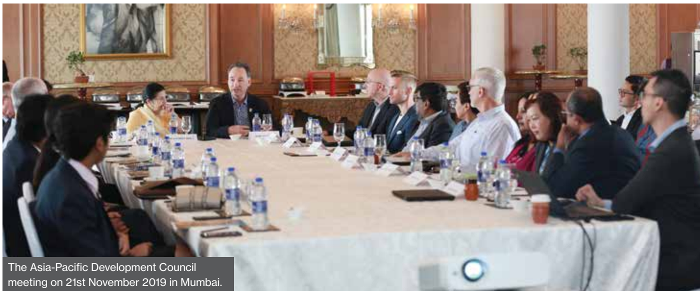
The Asia-Pacific Development Council meeting on 21st November 2019 in Mumbai.