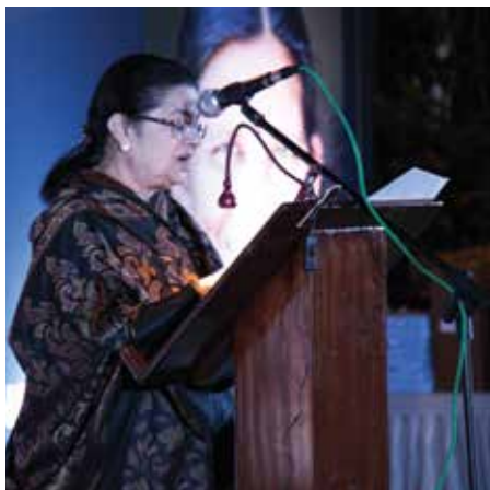
Smt. Rajashree Birla speaking at the Habitat India Gala Dinner on 21st November 2019 at the Willingdon Sports Club, Mumbai.

Habitat for Humanity's Asia-Pacific Development Council (APDC) is a group of prominent leaders who incite passion and enthusiasm in their individual industries, to build decent shelter across the Asia-Pacific region.