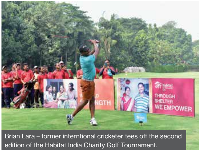
Brian Lara – former international cricketer tees off the second edition of the Habitat India Charity Golf Tournament.

Extending the spirit of sportsmanship and magnanimity he shows in the sports field to areas of social responsibility, legendary international cricketer Brian Lara urged sportspersons to support community development initiatives, as he inaugurated the second edition of Habitat for Humanity India's Charity Golf Tournament. The second edition of Habitat for Humanity India Charity Golf Tournament played at Willingdon Sports Club, Mumbai saw Brian Lara tee off on 6th December 2019.