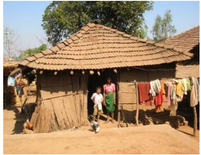
A typical Karvi house in this Karjat Taluka