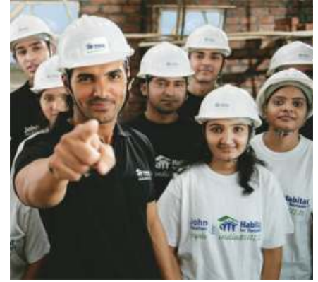
Goodwill Ambassador John Abraham has been instrumental in mobilizing 899 Volunteers to “Join John’s Brigade” Campaign

Global Village, part of Habitat's overall volunteer mobilization effort, offers participants a unique opportunity to become active partners with people of another culture. Team members work alongside members of the host community, raising awareness of the burden of poverty housing and building decent, affordable housing worldwide. As partners, team members help build a true “Global Village” of love, homes, communities and hope. This year HFH India hosted 27 Global Village Teams from Australia, Canada, Great Britain, Holland, Japan, Korea, North Ireland, Saudi Arabia and USA.