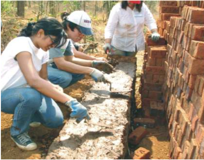
B.D. Somani School Volunteers at build site