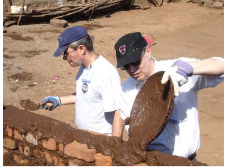
Diplomatic Corps at the build at Karjat, Maharashtra