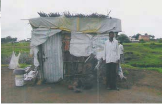
🏠 The family's old house