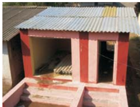
🏠 House with Tetra Pak Roof

Habitat for Humanity has built houses with this roofing material for 12 families in the first phase of the project at Maharashtra. Daman Ganga Group supported Habitat by providing 560 Tetra-Pak sheets.