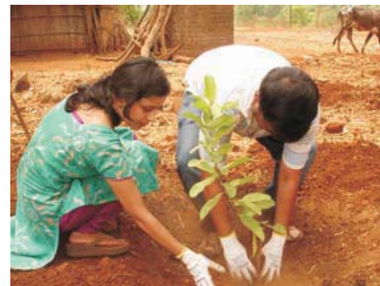
🏠 Volunteers from Wells Fargo