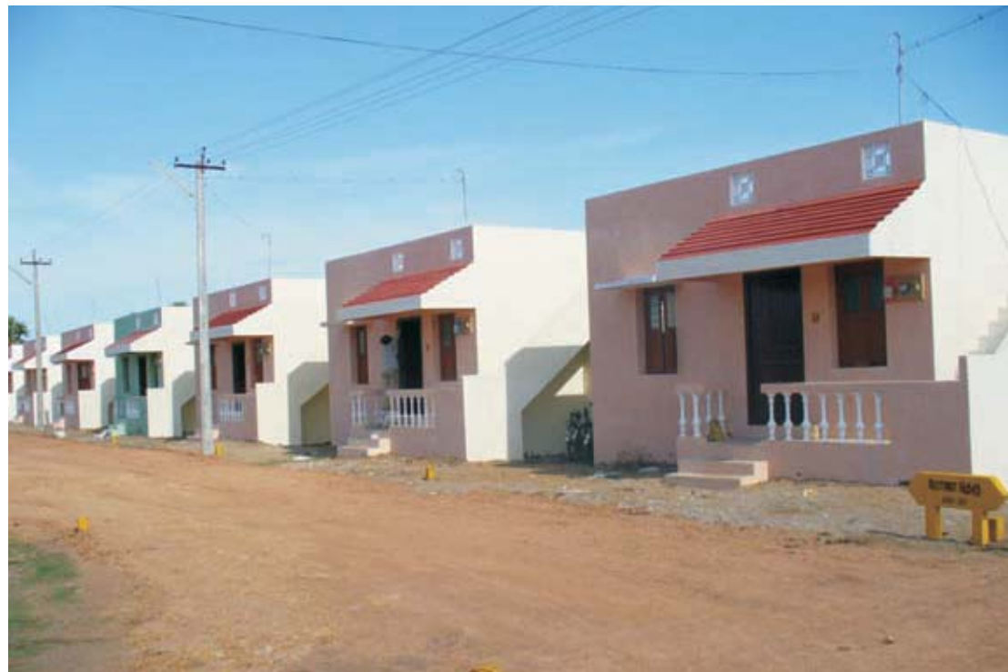
🏠 Tsunami Reconstruction at Thazhankuda Village, Tamil Nadu

9,000 tsunami-affected people have been trained in disaster mitigation, in a seven-month program, covering 41 villages in the districts of Cuddalore, Villupuram and Pondicherry in the southern State of Tamil Nadu.