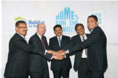
ETA Star Properties with their partners join hands with Habitat for Humanity

This first year, of the three year partnership, saw the donation of an amount of US$545,000, received through this campaign.