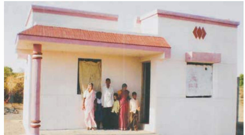
🏠 Family proudly standing in front of their new house

On being selected by the selection committee for support for the house under Habitat's project, husband and wife worked on the construction site to save costs and realize their dream. The couple now lives in their new house with their children. "The safety and security of a permanent home have helped in improving the health of the family which as directly resulted in reduced absenteeism from school of the children. We are thankful to Habitat for Humanity for their confidence and support shown to us and will ensure the regular repayment of the loan so that other families like may also benefit from the scheme."