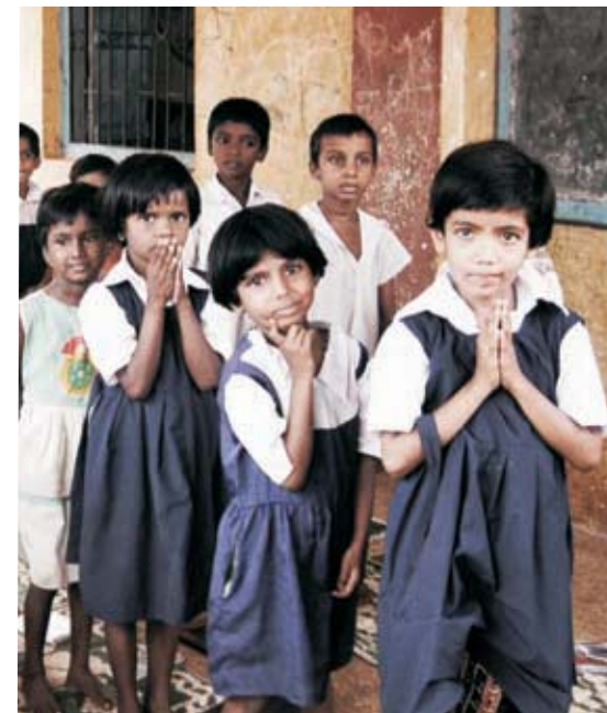
🏠 Changing the lives of children