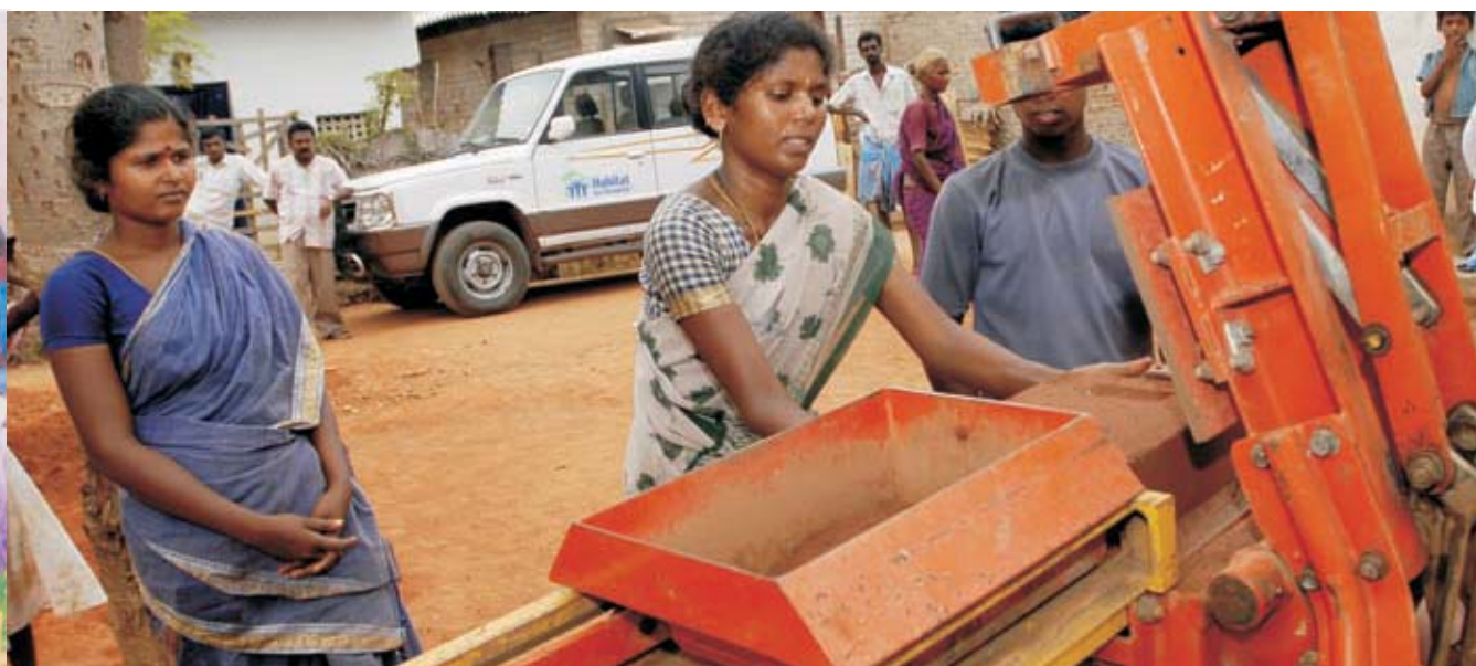
🏠 Women making compressed earth blocks in Chinnakottakuppam village