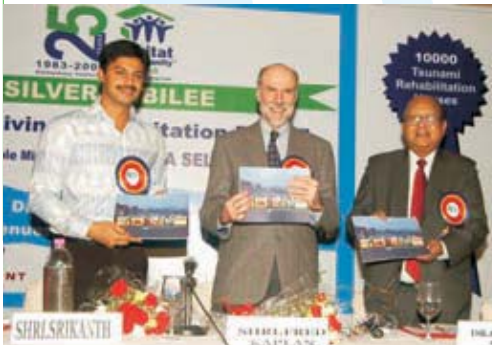
Release of the report "A perspective on Habitat for Humanity's Work with Tsunami Affected Communities in India" by the Chief Guest.