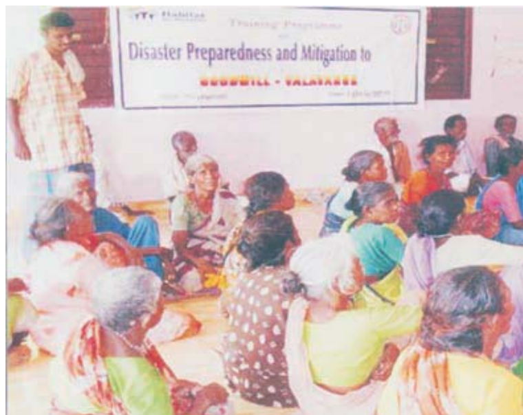
🏠 Capacity building program at the community level on Disaster preparedness and mitigation