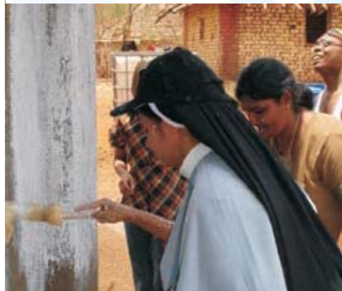
Volunteers at the Interfaith Build at Kalyan, Maharashtra

Prayers for Shelter on 21 st September were offered in 2450 churches across India and across different Christian denominations. Special builds were organized on this day-which included the interfaith build in Bangalore, Students build in Madurai, Women's Build and Home Partner's Build in Kanyakumari.