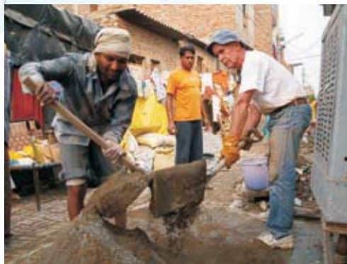
Habitat beneficiary and Volunteers working together at the GlobalBUILD site at Bhalaswa, Delhi

GlobalBUILD , a volunteering engagement initiative of HFH, brought Volunteers from around the world to help families in the slum resettlement colony of Bhalaswa, Delhi, to build decent homes. 73 volunteers of all ages and from varied walks of life, hailing from USA, Canada, Korea, Japan and Australia worked along with teams from India, in building houses for the families in the settlement, from 29th Sept-06th Oct, 2008.