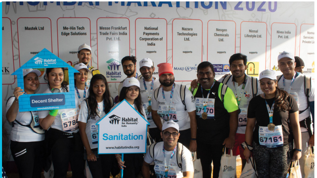
Employees from Messe Frankfurt running in the Tata Mumbai Marathon 2020 on behalf of Habitat India

305 avid supporters participated and ran for Habitat for Humanity India in the Tata Mumbai Marathon on 19 th January 2020, in support of better shelter and sanitation across the country.