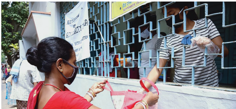
Distribution of Hygiene and Family Essentials Kits in Park Circus, Kolkata, West Bengal