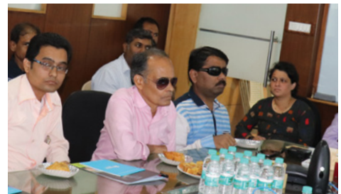
Vision Vangani consultation in Habitat India's office, Mumbai

health and education. After the lockdown caused by COVID-19 was announced, Habitat India provided essential items to 100 families thanks to our well-wishers and supporters.