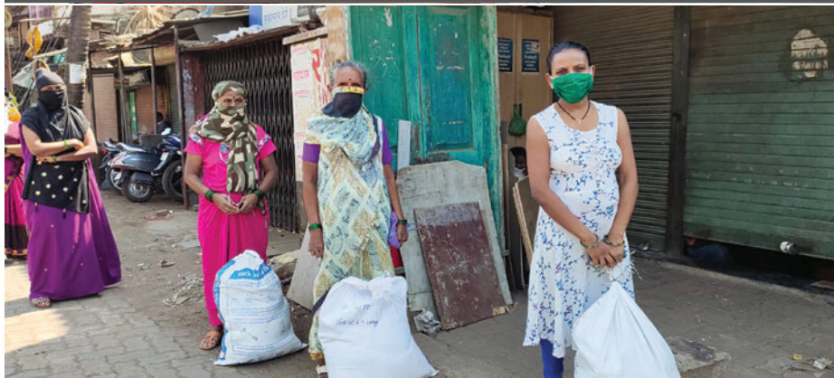
Women following social distancing norms as they collect their Hygiene and Family Essentials Kits in Mumbai, Maharashtra