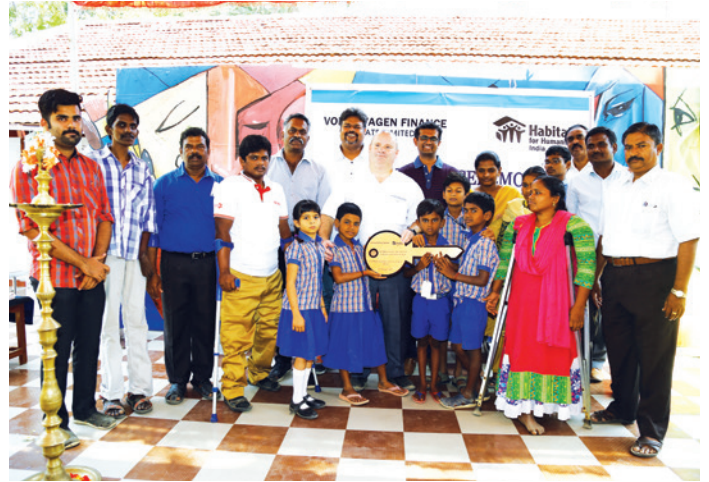
A sanitation unit was built for 275 specially-abled students in CSI Higher Secondary School for the Deaf, Chennai, in partnership with Volkswagen Finance Pvt. Ltd.