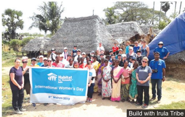
Build with Irula Tribe