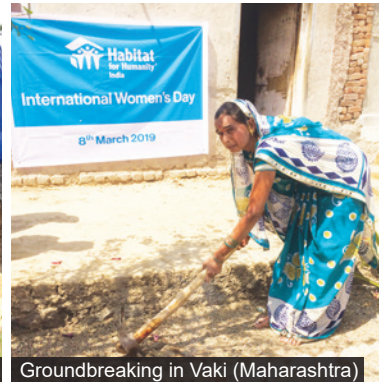
Groundbreaking in Vaki (Maharashtra)

Habitat for Humanity India celebrated International Women's Day on 8th March across the country standing in solidarity with the wives and families of CRPF Jawans martyred in the Pulwama attacks in Jammu and Kashmir.