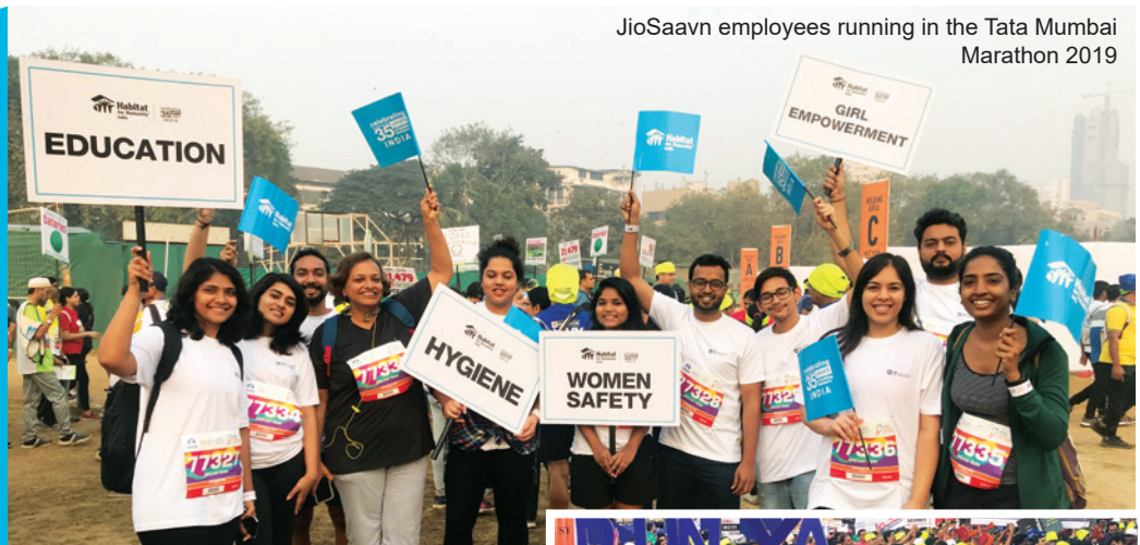
JioSaavn employees running in the Tata Mumbai Marathon 2019