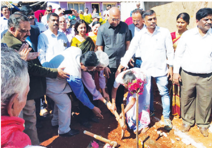
With support from Rotary Club of India a ground breaking for 25 homes was held in February 2019 in Madikeri, Kodagu for Karnataka flood relief.