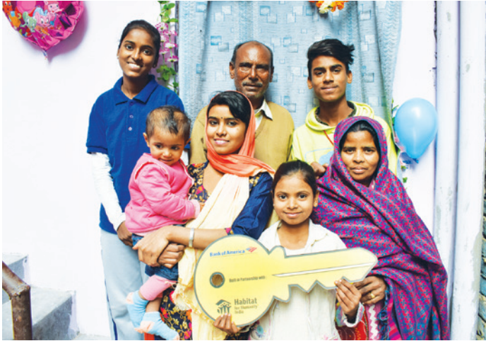
10 homes in Madanpur Khaddar and 1 from Rohini Sector 27, Delhi were handed over to Habitat homeowners in January 2019. The homes were built with support from Bank of America.