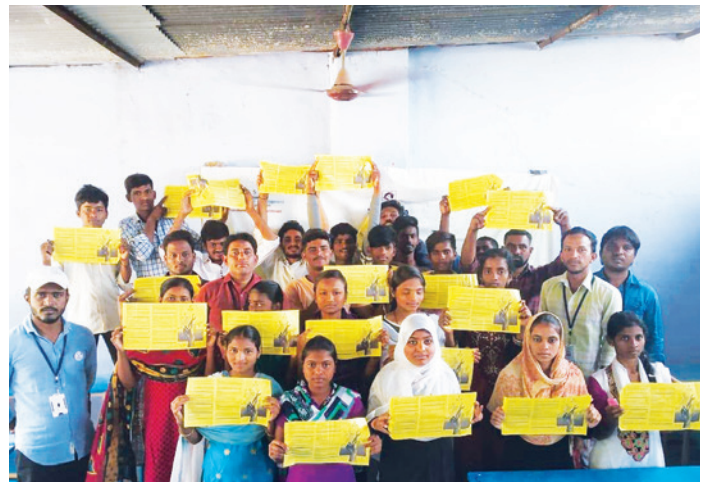
Skill Sathi is an initiative by Government of India to train over 40 Crore youth in different skills by 2022. Habitat India is the Counselling Implementing Organisation and has reached out to 15,321 youth as of 31st March 2019.