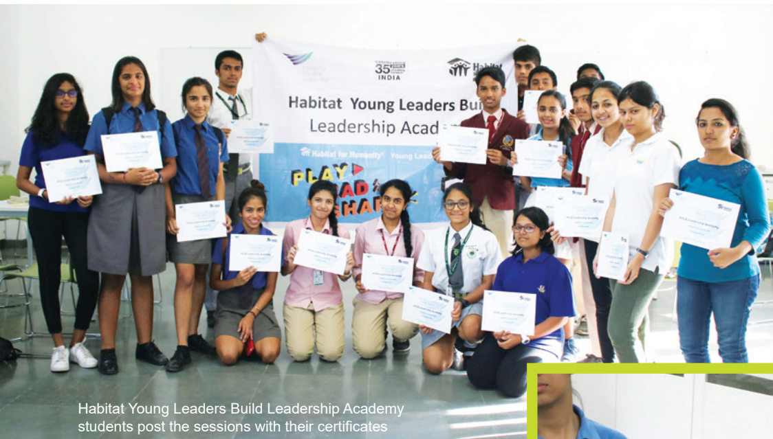
Habitat Young Leaders Build Leadership Academy students post the sessions with their certificates

Habitat for Humanity India's first ever Habitat Young Leaders Build (HYLB) Leadership Academy training in schools took place in March 2019 in Bengaluru.