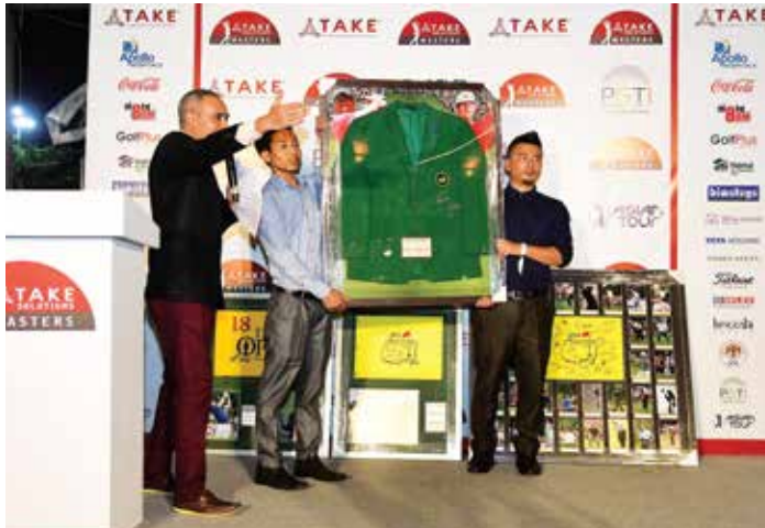
Auctioning the famous Green Jacket signed by "The Masters"