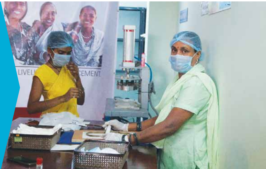
Women from the SHG working at the Sanitary Napkin manufacturing unit