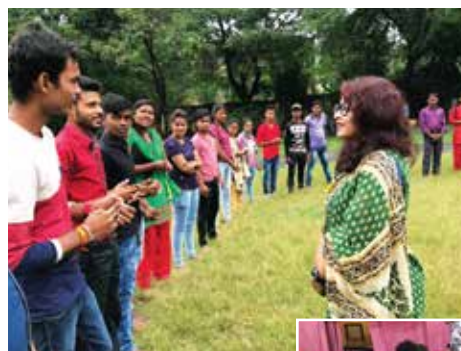
Outdoor Ice-breaker Activity

The training-workshop began with an ice-breaker and included key topics including sustainable communities, creating gender equality, leadership 101 and working in teams. Groups also developed their own action plans and demonstrated how they would build a sustainable community of their dreams!