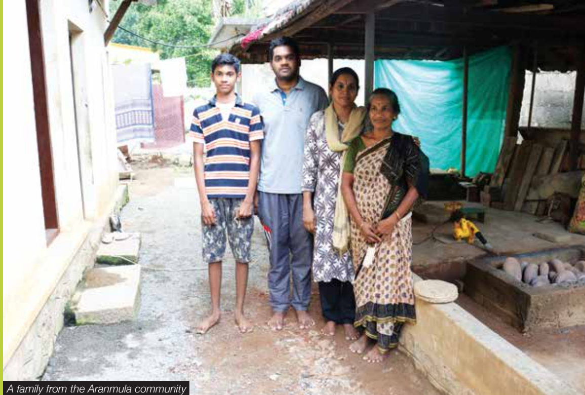
A family from the Aranmula community

Walking into the temple town of Aranmula, in the district of Pathanamthitta, Kerala is a sobering experience.