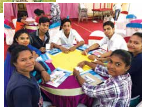
A team listening intently to the sessions