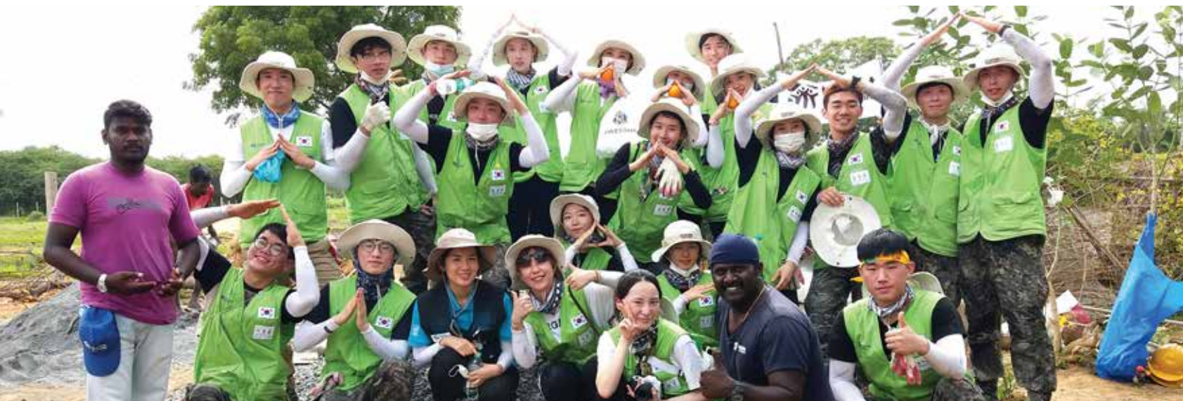
Happy Move with the Hyundai Motors Group was a huge success