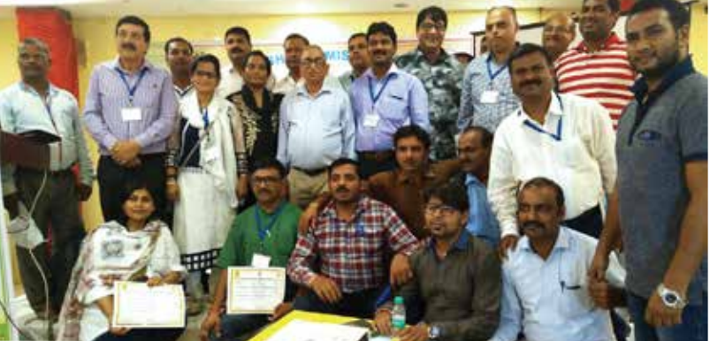
An orientation on Community Approach to Sanitation was conducted by the Ministry of Drinking Water and Sanitation for newly appointed Key Resource Centres. 5 members from Habitat India participated in this at Gorakhpur from 19th to 23rd August, 2017.