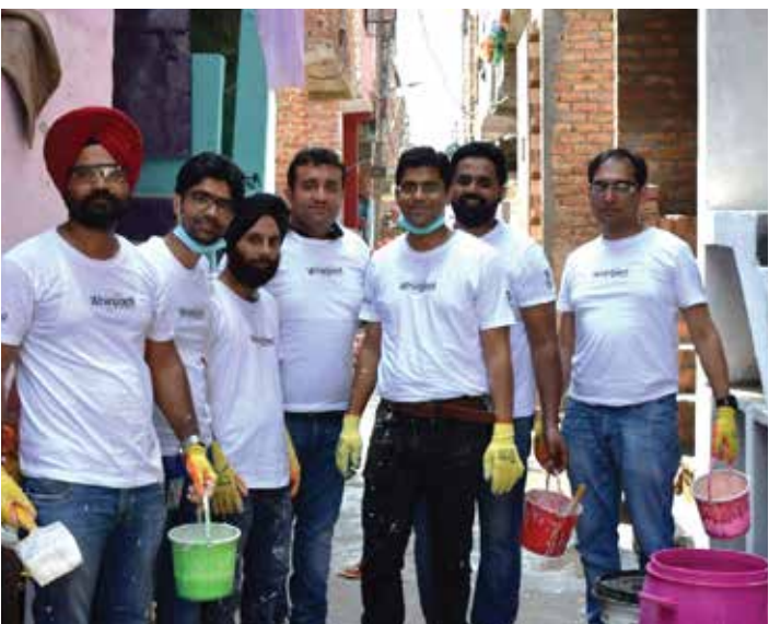
The Whirlpool team in Delhi