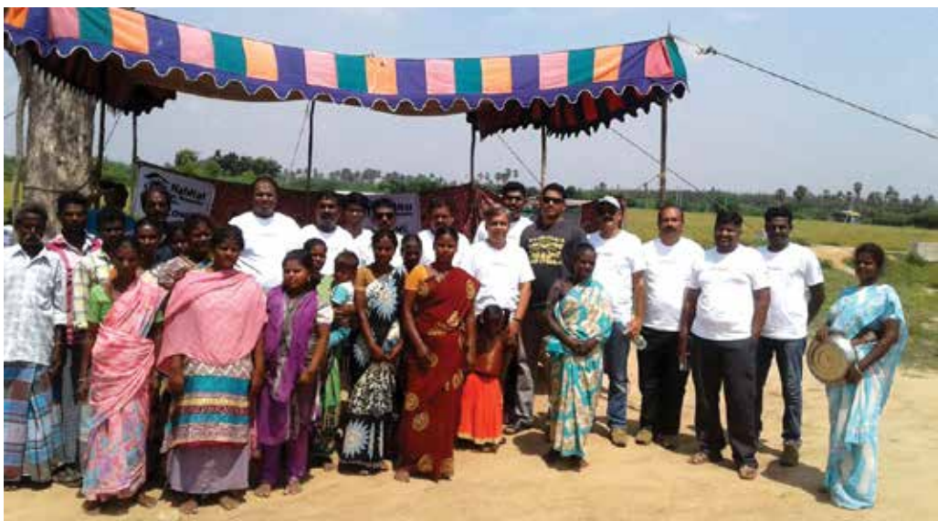
Whirlpool team in Pondicherry