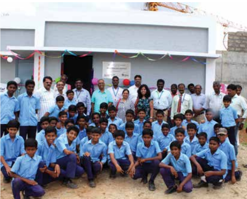
Over 2000 students across 4 schools will now have access to a toilet in Bengaluru