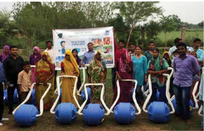
In a handover ceremony held on 8 August 2017, Habitat India in partnership with Rajputana Society of Natural History provided 50 water wheels to underprivileged families in Bharatpur.