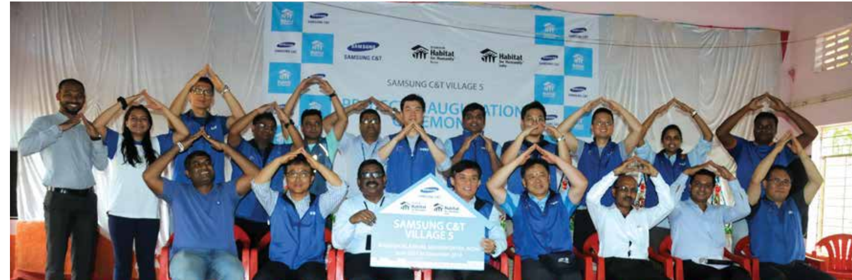
The teams from Samsung C&T and Habitat India at the handover ceremony

Samsung C&T has joined hands with Habitat India with the aim to build a better future for tribal families residing in the hamlets of Karjat through the Samsung C&T Village 5 project. The partnership will support 55 families to construct a safe and decent house. These families will additionally receive a water wheel device that will ease their effort in fetching water and storing it. The project extends to help a school in one of the villages in Karjat with smart classrooms. This will impact the lives of over 400 children in the community who