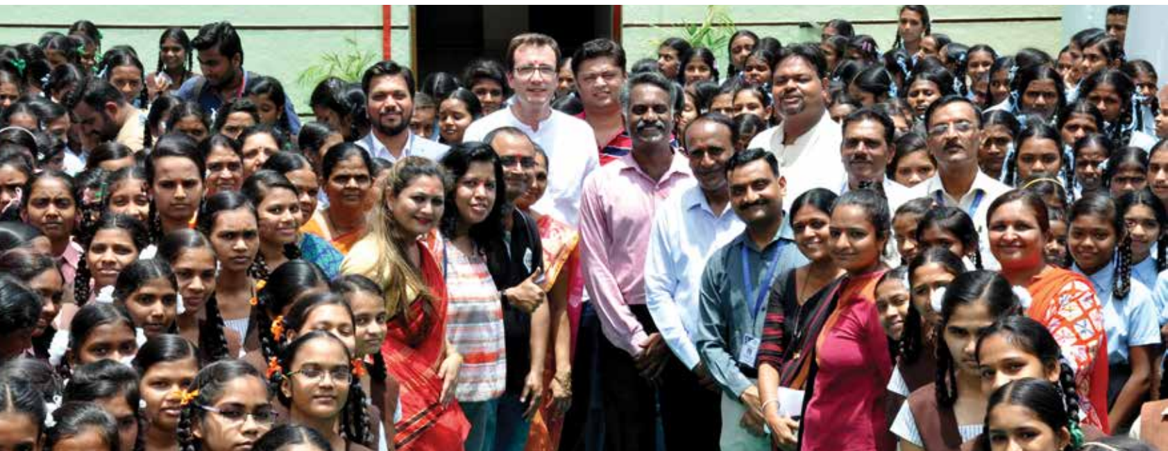
700 tribal girls will benefit through the sanitation complex in Silvassa

Volkswagen Finance Pvt Ltd and Habitat for Humanity India have built a sanitation complex for the girl students of the Government Sarvottam Higher Secondary School in Silvassa. The 1,500 square feet sanitation complex consists of 20 urinals and 13 lavatories. It will cater to nearly 700 female students and 25 female teachers. The students belong to tribal families and travel from far off places to attend school. Prerna Sopandev Patil, from class 11 said “We faced lot of problems earlier as there was only one toilet in the school and water