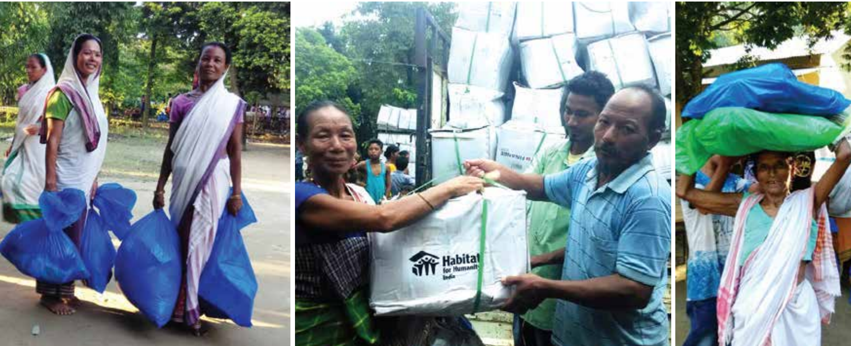
Post the devastating floods in Assam, families were reached out as an immediate response

Owing to the heavy rains and consequent flooding in Assam this year, Habitat India has been on ground reaching out to affected families in various flood-hit districts.