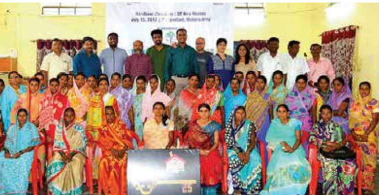
On 15th June, 2017 Willis Towers Watson handed over 50 new homes to farmer widows and their families in Osmanabad thus impacting the lives of 250 individuals.