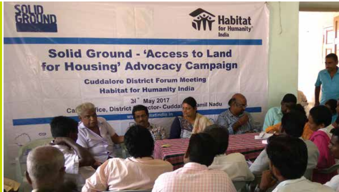
Habitat India launched the Solid Ground Advocacy Campaign in Cuddalore, Tamil Nadu

Solid Ground Advocacy Campaign will address access to land to build disaster resilient communities with an added focus on gender equality