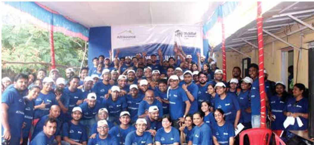
The Altisource team at Manori

"Such initiatives bring value and make our employees more capable."