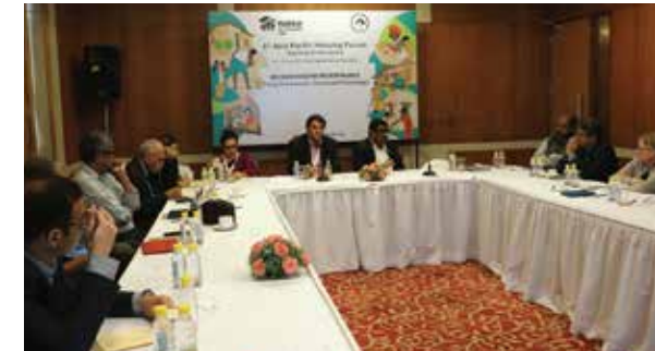
A High Tea meeting was conducted with distinguished leaders in the housing microfinance sector.