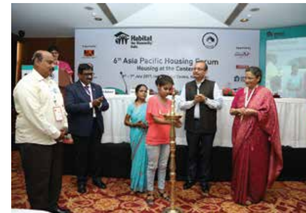
The inauguration of APHF6 in New Delhi with the dignitaries and Habitat for Humanity's home partners.