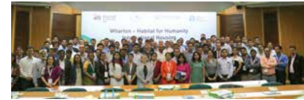
Participants of the Wharton - Habitat for Humanity International Housing Finance Course

Asia Pacific Housing Forum 6 was supported by the Aditya Birla Group, Aavaas by Nebula, Covestro (India) Private Limited, HDFC Ltd and National Housing Bank in partnership with Dasra, Real Estate Management Institute (REMI) and UN Global Compact Network India.