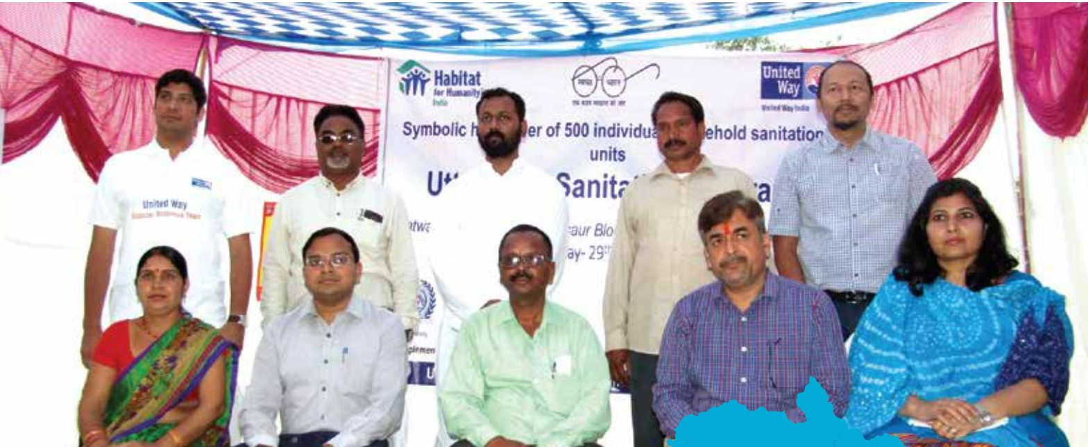
The Habitat for Humanity India team and United Way India team at the handover ceremony

Habitat for Humanity India in partnership with United Way India has constructed 500 sanitation units in 13 villages of Uttarkashi district in Uttarakhand. A symbolic handover of these 500 toilets took place in Barshali village in the presence of the community, district administration, Swajal department (a World Bank funded project dedicated for the cause of water supply and environmental sanitation), officials from Habitat for Humanity India and United Way India on May 29th, 2017.