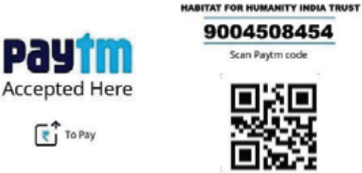
Habitat India can now accept donations through Paytm, here's our Paytm QR code. Our mobile no. is 9004508454. Do share in your network and support our cause.