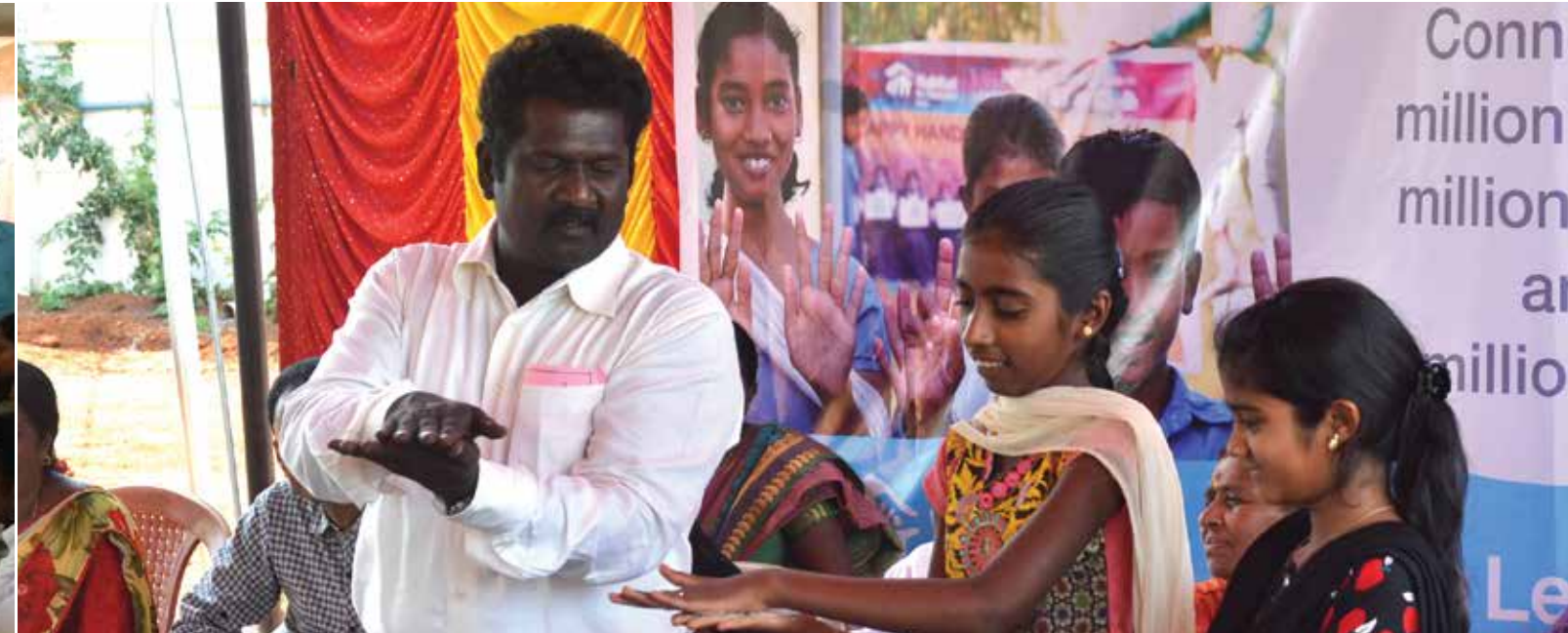
Various activities were conducted across India during Habitat Young Leaders Build 2017

Habitat Young Leaders Build 2017 (HYLB) campaign engaged with more than 2 million volunteers and participants in India to raise awareness about housing, sanitation, health and hygiene. The campaign kicked off on International Volunteer Day on 5th December, 2016 and culminated on 22nd April, 2017. Through the campaign, thousands of young people from various schools and corporates across India built homes, raised funds, spread awareness and advocated for decent shelter. The highlight of HYLB 2017 was the 'Build with Evelyn' event wherein renowned Bollywood actor and model Evelyn