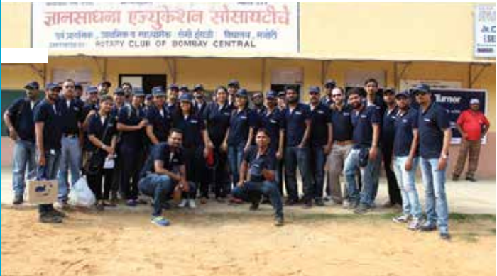
On 6th May, 2017 32 employees from Turner Construction Company participated in a Volunteer Build at Dyansadhana Madhyamik Vidyalaya in Manori, Mumbai.