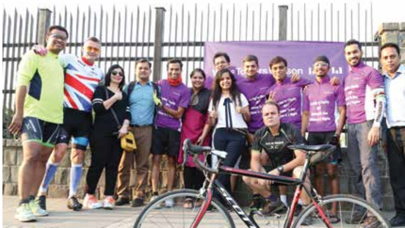
Cycling for Charity: Willis Tower Watson Cycled from Mumbai to Goa to raise funds for Habitat India