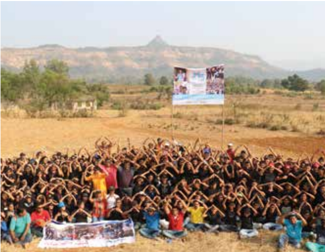
Habitat Young Leaders Build: 350 students from Sacred Heart School, Kalyan build with Habitat India in Karjat.