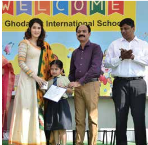
Rupee for Change: Actor Sagarika Ghatge felicitated the students of Sanjay Ghodawat International School, Kolhapur (Maharashtra) for their contribution to Habitat's Rupee for Change campaign.