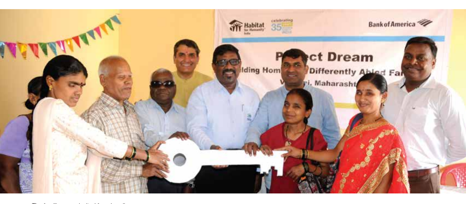
The families were invited for a handing over ceremony

After living in dilapidated makeshift houses, overcrowded conditions and apartments with escalating rents for years, 16 visually impaired families from Vangani now have realized their dream of living in a safe and a decent home. In partnership with BA Continuum India Pvt. Ltd, Habitat has built a multi-storied building providing affordable homes to these 16 families in Vangani.