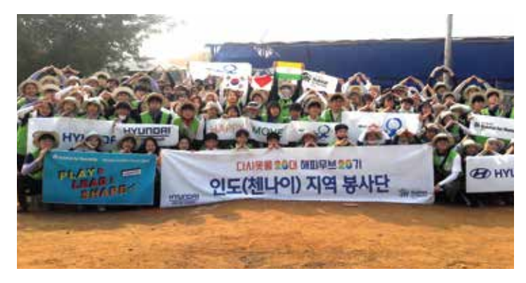
Participants at the Happy Move build

On 20th January 2018 over 200 employees from Altisource Business Solutions Pvt. Ltd., Samsung Construction and Technologies and Willis Towers Watson Mumbai helped build houses for 9 families at Bangarwadi, Karjat (Maharashtra).