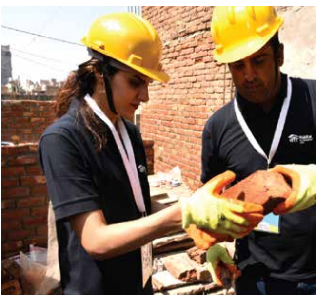
Inauguration of the Asian Tour Golfers Build