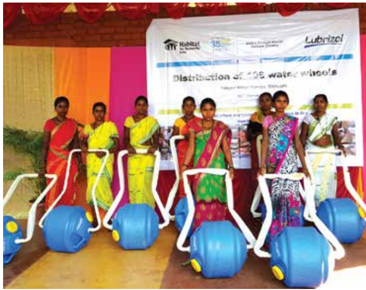
Fractal Anaytics and Lubrizol Corporation distributed water wheels to families in Shilonda

Water wheels were distributed to families in the village of Shilonda, Palghar district (Maharashtra) with support from Lubrizol Corporation and Fractal Analytics on 10th and 12th March 2018 by the two organizations respectively.