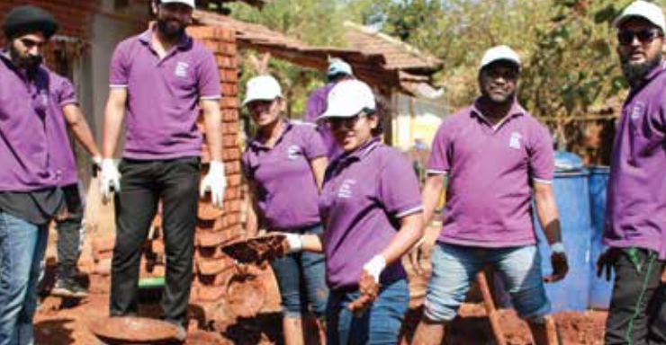
HYLB Big Build saw over 200 volunteers working on building decent homes