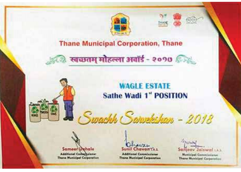
The sanitation complex built by Habitat India in Sathewadi was awarded the 'Swachhatam Mohalla Award' by Thane Municipal Corporation for keeping the surrounding clean and hygienic.