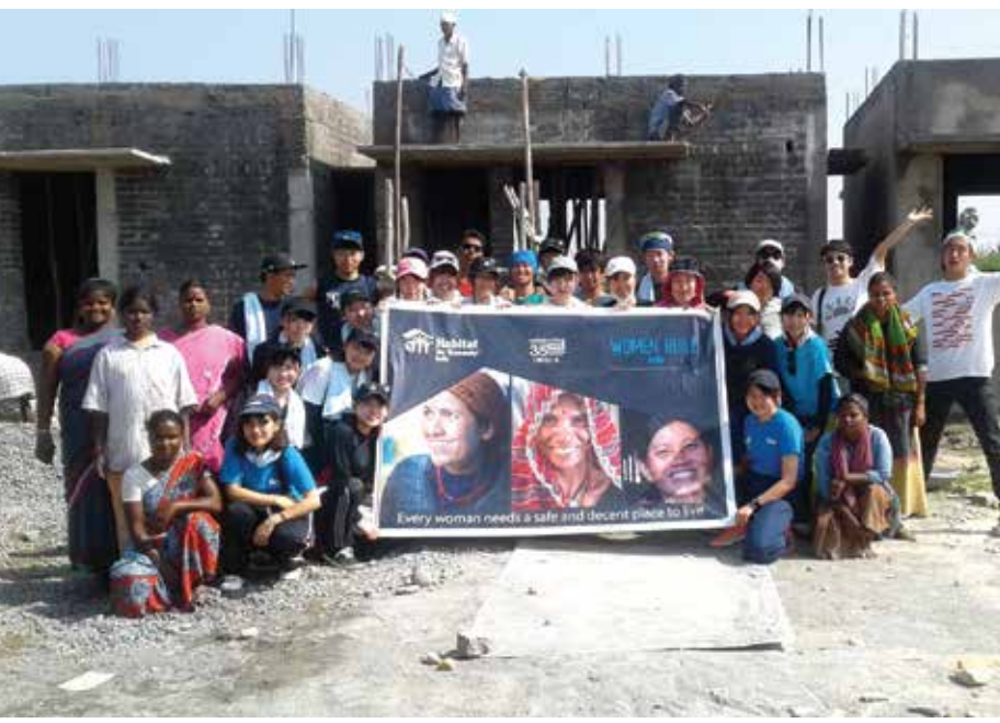
International women's week was celebrated with enthusiasm and excitement by Habitat India volunteers

To commemorate Women's Day which is observed every year on 8th March, over 1,700 women across the country were reached out to in a week-long celebration through advocacy and awareness initiatives as well as Habitat builds. 13 women from United Kingdom and 7 women from Northern Ireland along with 110 students from Japan celebrated the