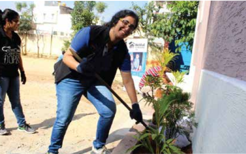
12 employees from Texas Instruments participated in Habitat India's build and plantation activity at Bangalore, Karnataka.