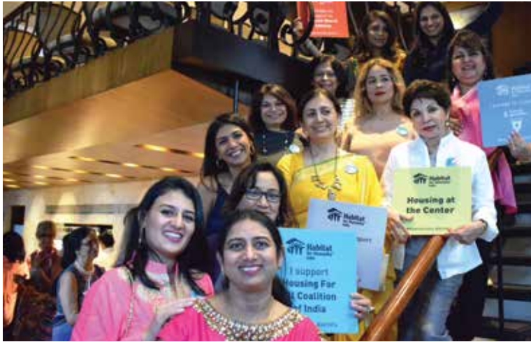
The Women Build India Committee organized a high tea to raise funds for Habitat India