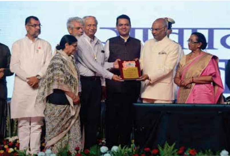
CEPT University, Habitat's Sensitise to Sanitise (S2S) Coalition partner, was felicitated by Shri Ram Nath Kovind in the presence of the Chief Minister and the Governor of Maharashtra for providing 360,000 families household latrines and supporting the Swachh Maharashtra Urban Mission.