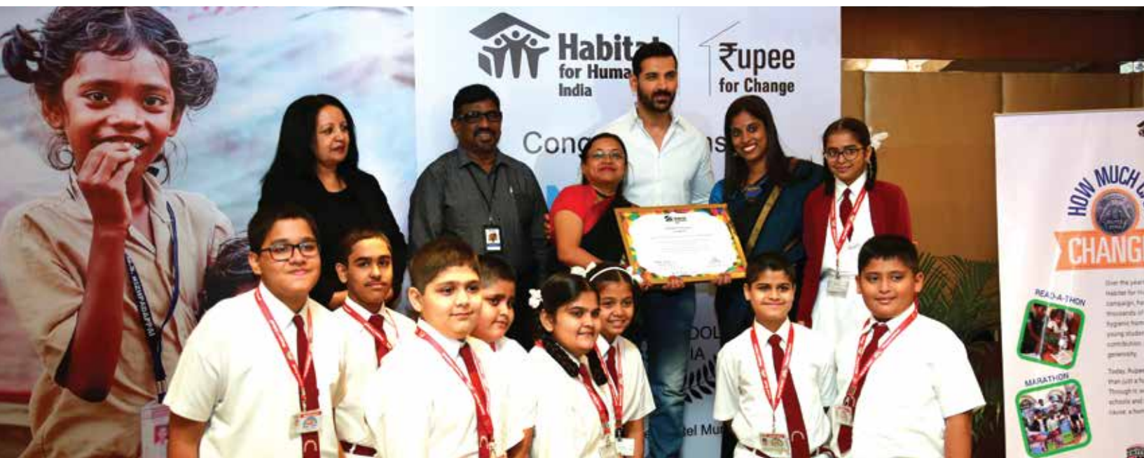
Bollywood actor John Abraham encouraged all the students to continue supporting Habitat for Humanity India