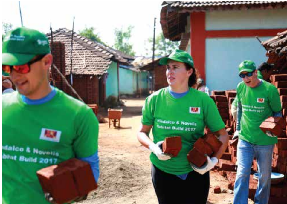
Hindalco and Novelis employees at the build site

In a two day build, 70 employees from the Aditya Birla Group companies - Hindalco and Novelis - volunteered with Habitat to build four homes for four families in Jambulwadi village, Karjat, Maharashtra. These four families earlier lived in dilapidated homes with poor foundations and thatched roofs. Due to limited funds and resources, the families were unable to rebuild or repair their homes.