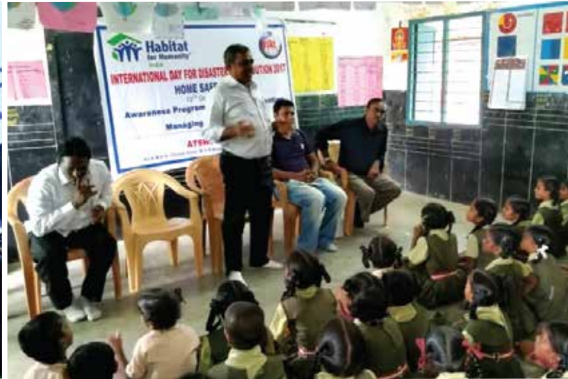
Over 250 students and 8 teachers participated in the School Disaster Management Training Program conducted by Habitat India at the Government Middle School in Tirupali Village, Tiruvallur District, Chennai.