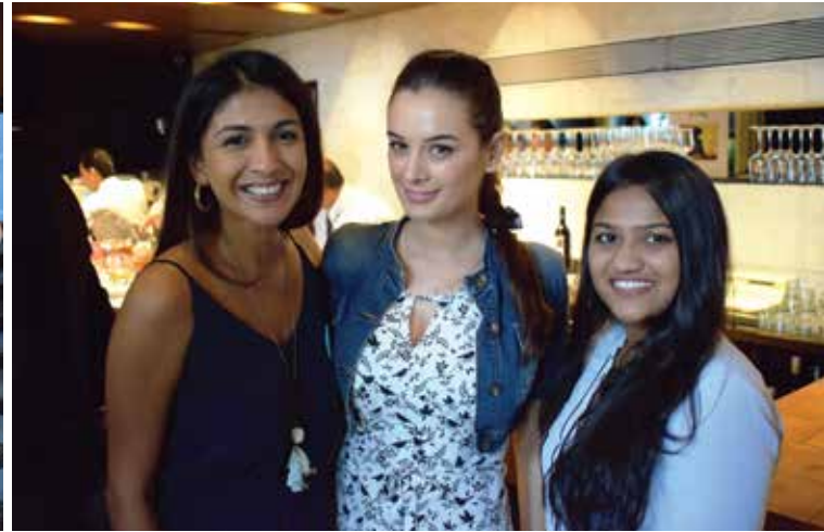
Bollywood actress Evelyn Sharma at the event