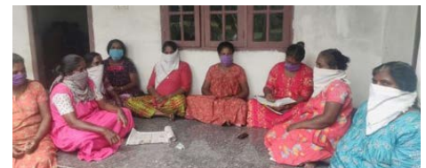
Training of Women Leaders and Self Help Group formation in Mundar, Kerala

Swayam Sikshan Prayog has supported Habitat India in implementing the project.