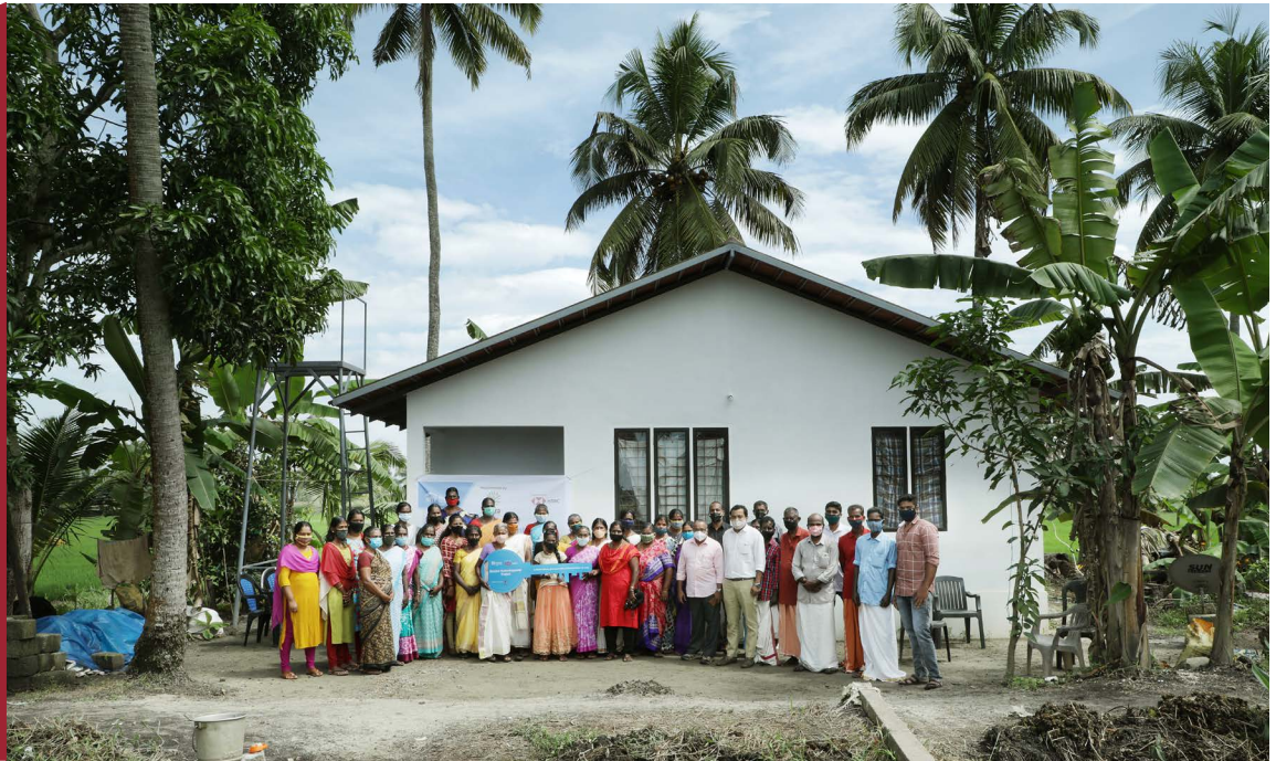
26 Habitat homeowners gather to take the key to their new homes in Mundar, Kerala

The devastating floods of August 2018 severely affected the village of Mundar and 236 families who reside in it. Two years later, the village has undergone a complete transformation thanks to the partnership between HSBC India and Habitat for Humanity India.