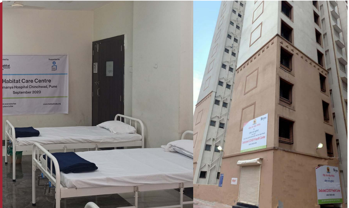
Inauguration of new Habitat Care Centres in Chinchwad, Pune (L) and Chakan, Pune (R), Maharashtra

In October 2020, with support from SBI Capital Markets Ltd and Pimpri Chinchwad Municipal Corporation, four Habitat Care Centres equipped with 125 beds were set up in Sant Dnyaneshwar Hospital (Nigdi), Lokmanya Hospital (Chinchwad), Sterling Hospital (Nigdi), and Star Hospital (Akurdi) in Pune (Maharashtra).