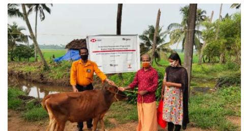
Distribution of livestock for livelihood and sustenance in Mundar, Kerala

The Mundar Development Project in Kerala is the second such holistic disaster response project undertaken in partnership by HSBC India and Habitat India.