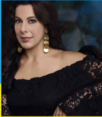
Pooja Bedi Actress and Motivational Speaker