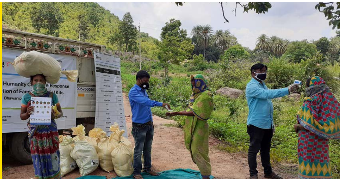
Distributing Hygiene and Family Essential Kits following social distancing and good hygiene in Bhawanipur, Kolkata

Habitat for Humanity India has been responding to COVID-19 pandemic since March 2020 through the Road to Recovery strategy, serving over 13,27,076 people through Family Essential Kits, Hygiene Kits, Conditional Cash Transfer, Behaviour Change Communication training and Habitat Care Centres (HCCs).