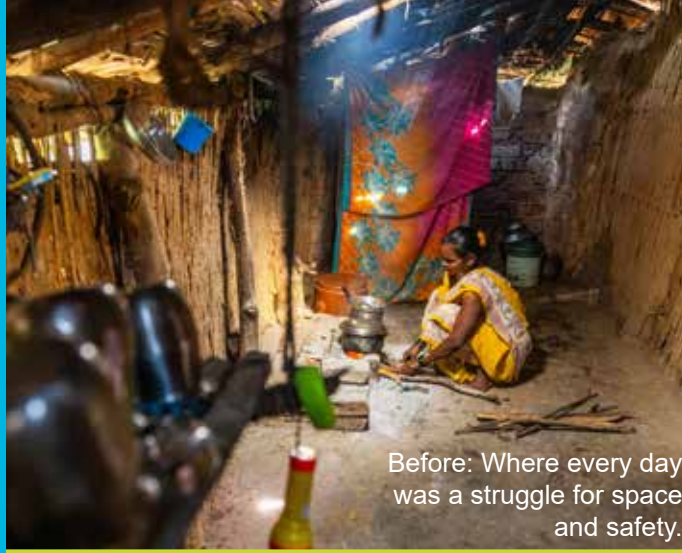
Before: Where every day was a struggle for space and safety.

A Habitat For Humanity India Newsletter January - March 2026