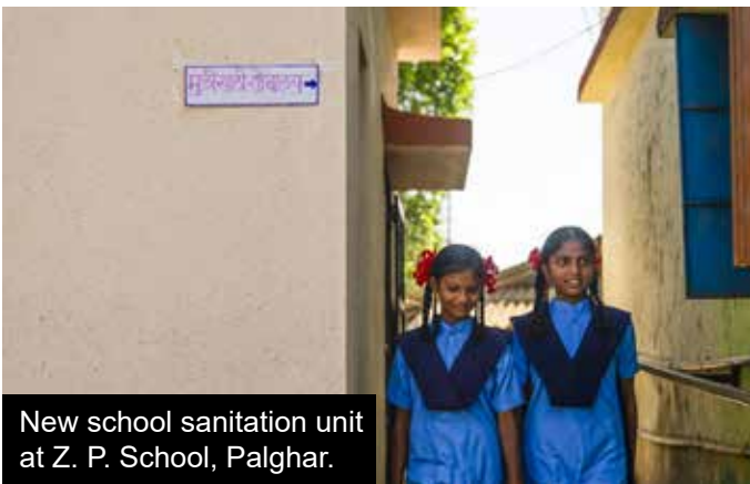
New school sanitation unit at Z. P. School, Palghar.