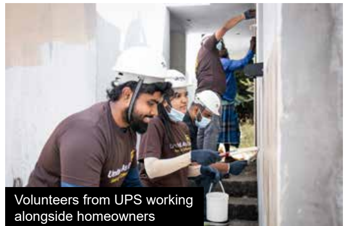
Volunteers from UPS working alongside homeowners

Each home has been thoughtfully designed to include a living room, bedroom, kitchen and a sanitation unit — supporting healthier living conditions and everyday dignity. For the families, these homes represent far more than physical structures; they offer security, stability and the confidence to invest in their futures.