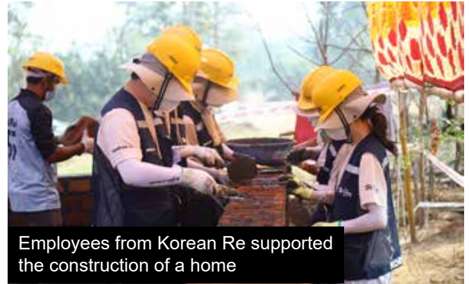
Employees from Korean Re supported the construction of a home