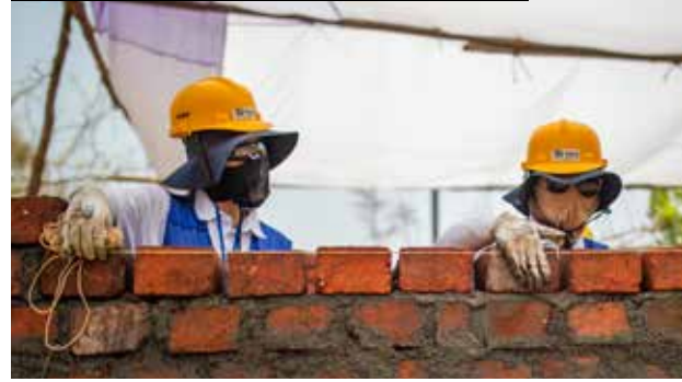
Samsung C&T employees contributing to the home construction.