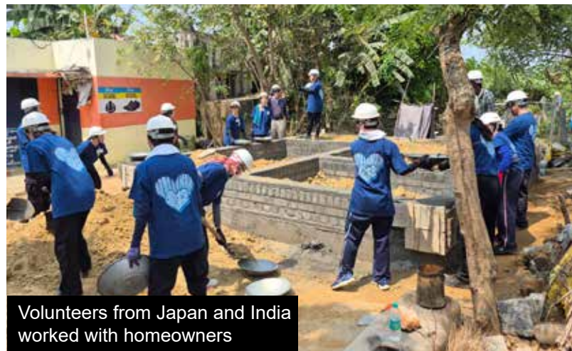
Volunteers from Japan and India worked with homeowners