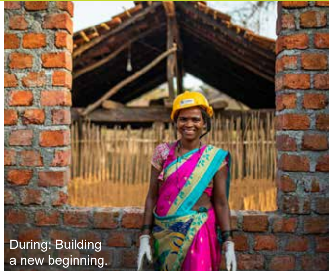
During: Building a new beginning.