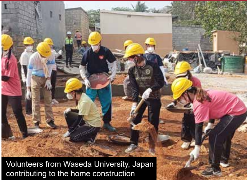
Volunteers from Waseda University, Japan contributing to the home construction