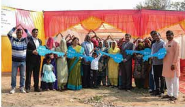
Haryana, February 10, 2026: Max Estates Limited, in partnership with Habitat for Humanity India, has completed the second phase of its affordable housing initiative in Haryana's Rewari district, providing safe and permanent homes to 54 families across two villages.